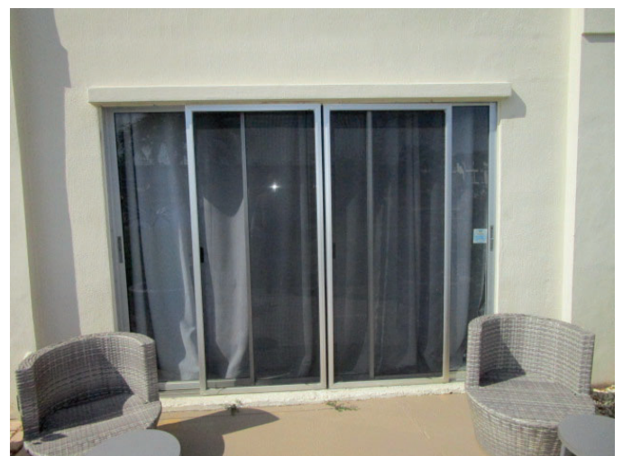
some sliders are non impact