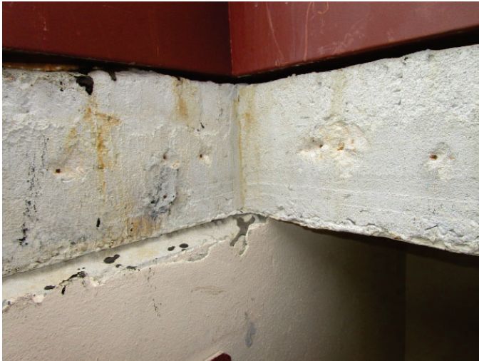
roof to wall attachment- structural- reinforced concrete