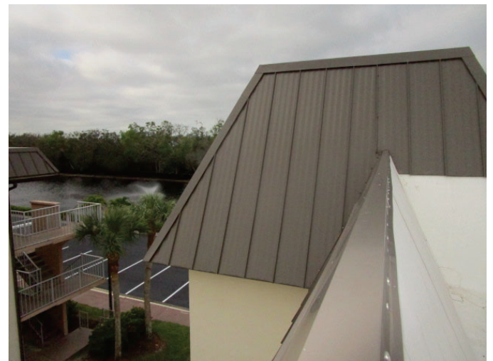
roof geometry- Flat w/mansard