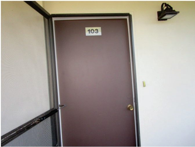
metal clad front entrances