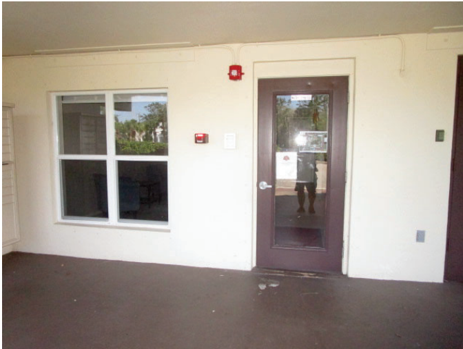
common area/lobby windows/doors w/metal panels