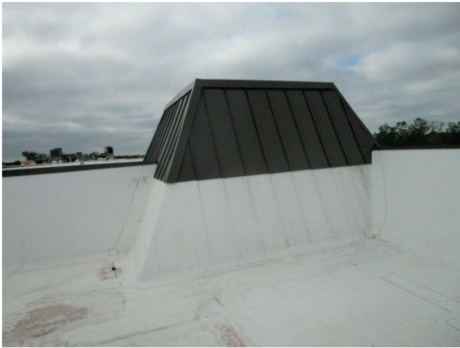
roof permit #PRBD2019-0835668 applied 8/20/2019