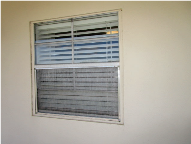
some windows are non impact