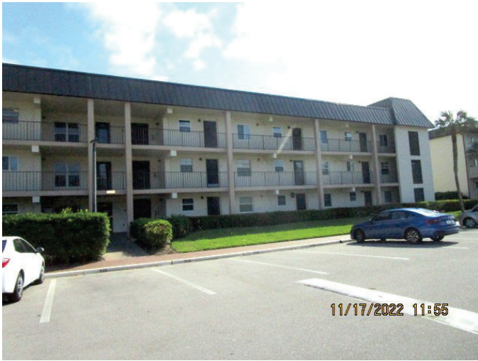
Gulf Winds Condo East: 1000 Manatee Rd Naples built 1973