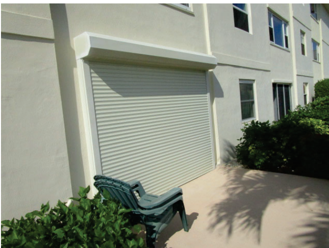
some non impact sliders have roll down shutters