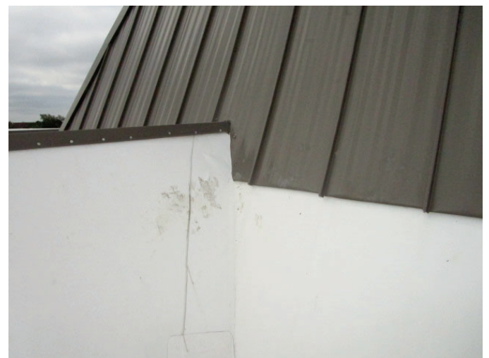
2019 TPO vinyl flat roof w/2019 Metal mansard